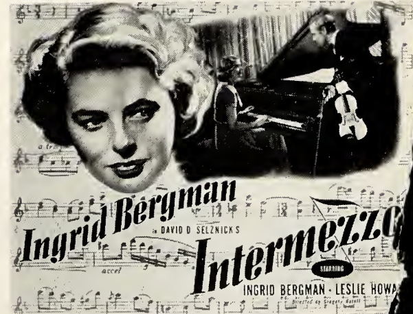
22 x 28

Order Accessories and 11x14 Lobby Sets from National Screen Service